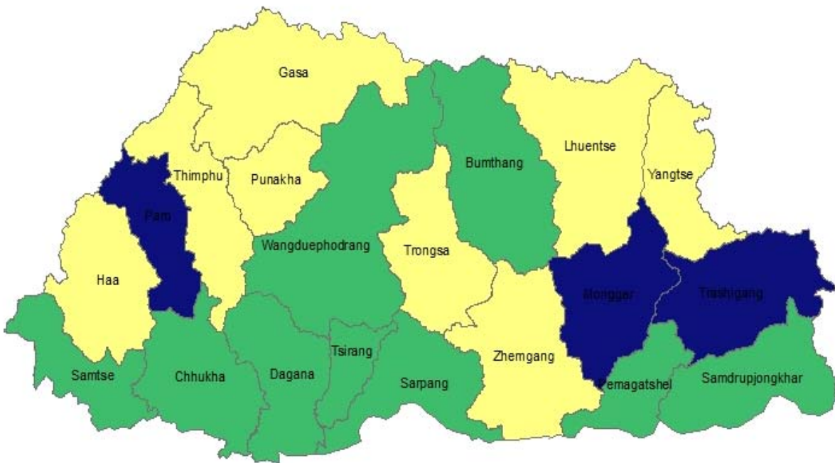
Improved Cattle Distribution